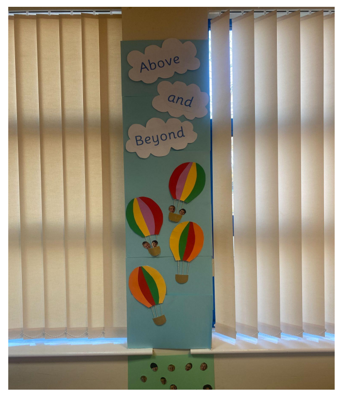
Appendix 1: Examples of Recognition board and Above and Beyond